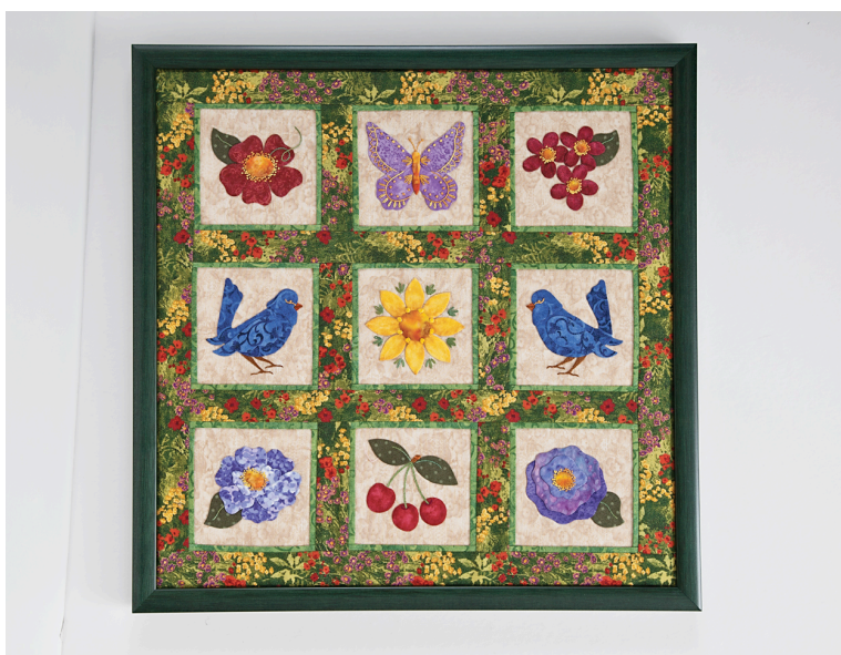
Just for Pretty Appliqué Sampler

Just for Pretty is just for fun with a whole lot of learning built in! Begin with a flower and you'll breeze through the remaining learn-as-you-go blocks. Each of the nine delightful appliqué motifs can be completed in a few hours. Complete the project as a framed piece (shown below). Notice that it is appliquéd only and not quilted, though of course quilting is an option, as you can make a pillow cover or a small wall hanging. Finished individually, a single block can be made into a mug mat, needle book, pocket, sticky notepad cover, framed art piece or whatever else you might dream up! Take a moment to look in the book's "gallery" on pp. 52-59, also, to see a variety of design interpretations!