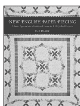
New English Paper Piecing by Sue Daley 10819