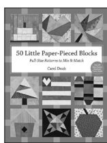
50 Little Paper-Pieced Blocks by Carol Doak 10858