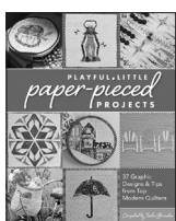
Playful Little Paper-Pieced Projects Compiled by Tacha Bruecher 11026