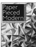
Paper Pieced Modern by Amy Garro 11088